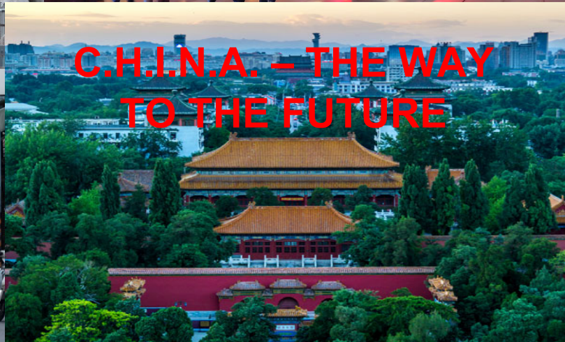
C.H.I.N.A. – THE WAY TO THE FUTURE